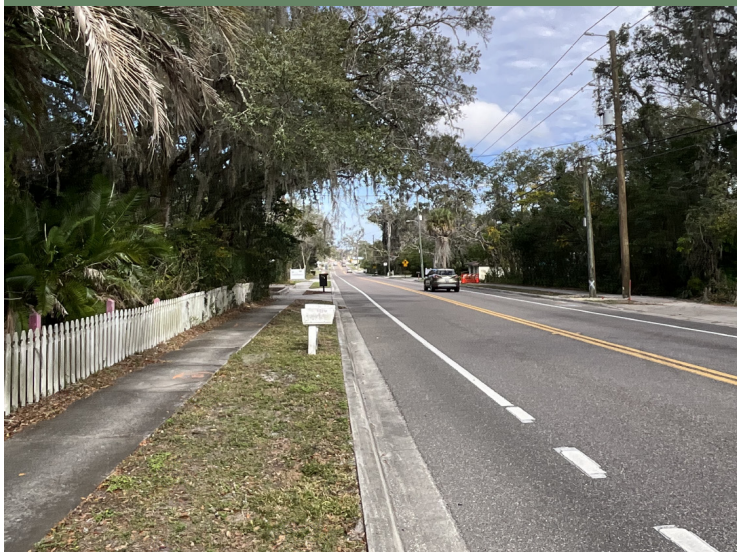
S.R. 434 NORTHBOUND

YOU'RE INVITED: During this community event, solutions will be presented for public feedback. Your participation and involvement is a critical component of the study process. We invite you to attend this community event and stay involved in the process.