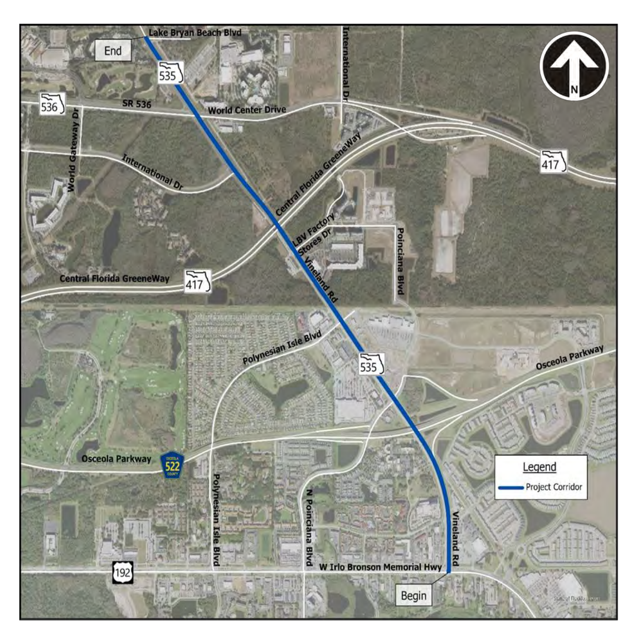
Figure 1-1 Project Location