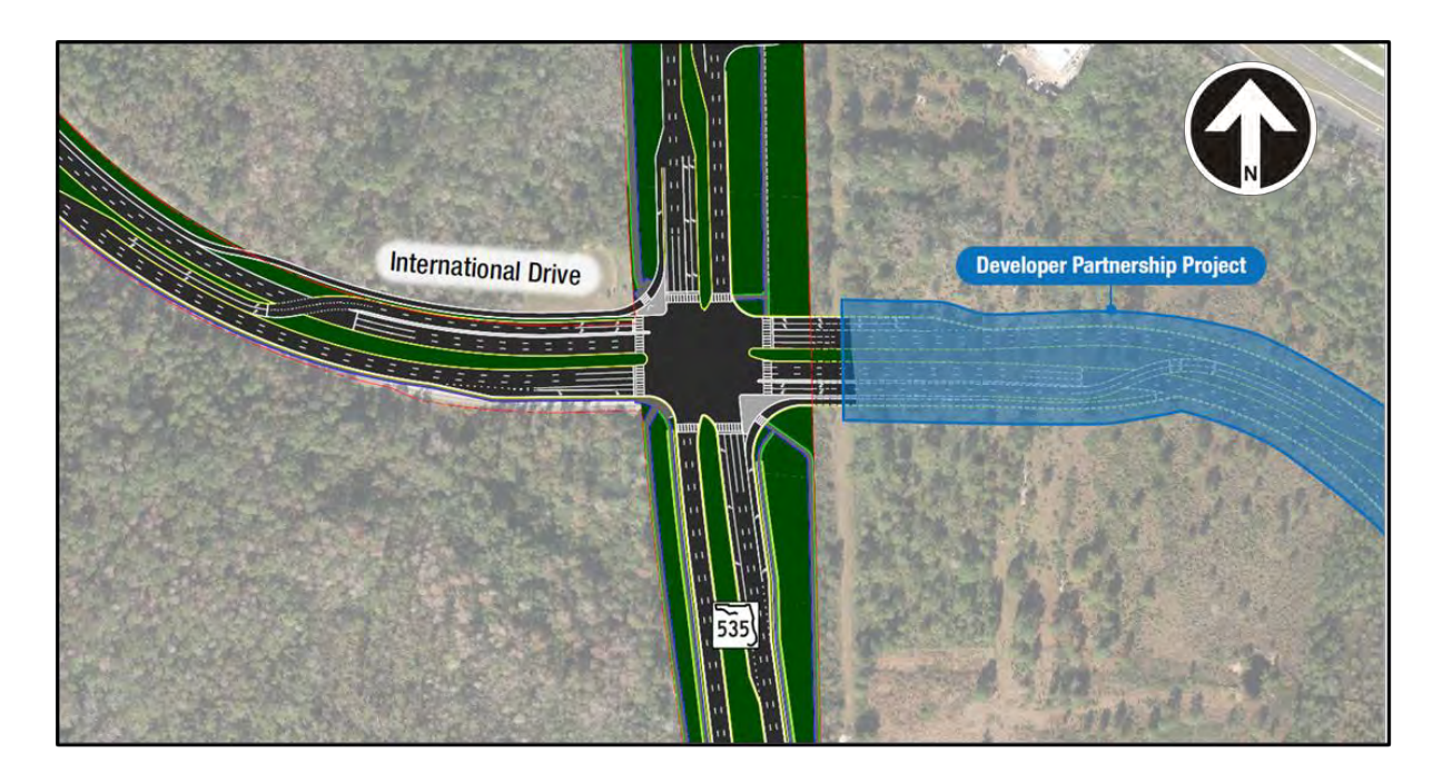
Figure 1-5 SR 535 and International Drive Partial Displaced Left Turn Alternative