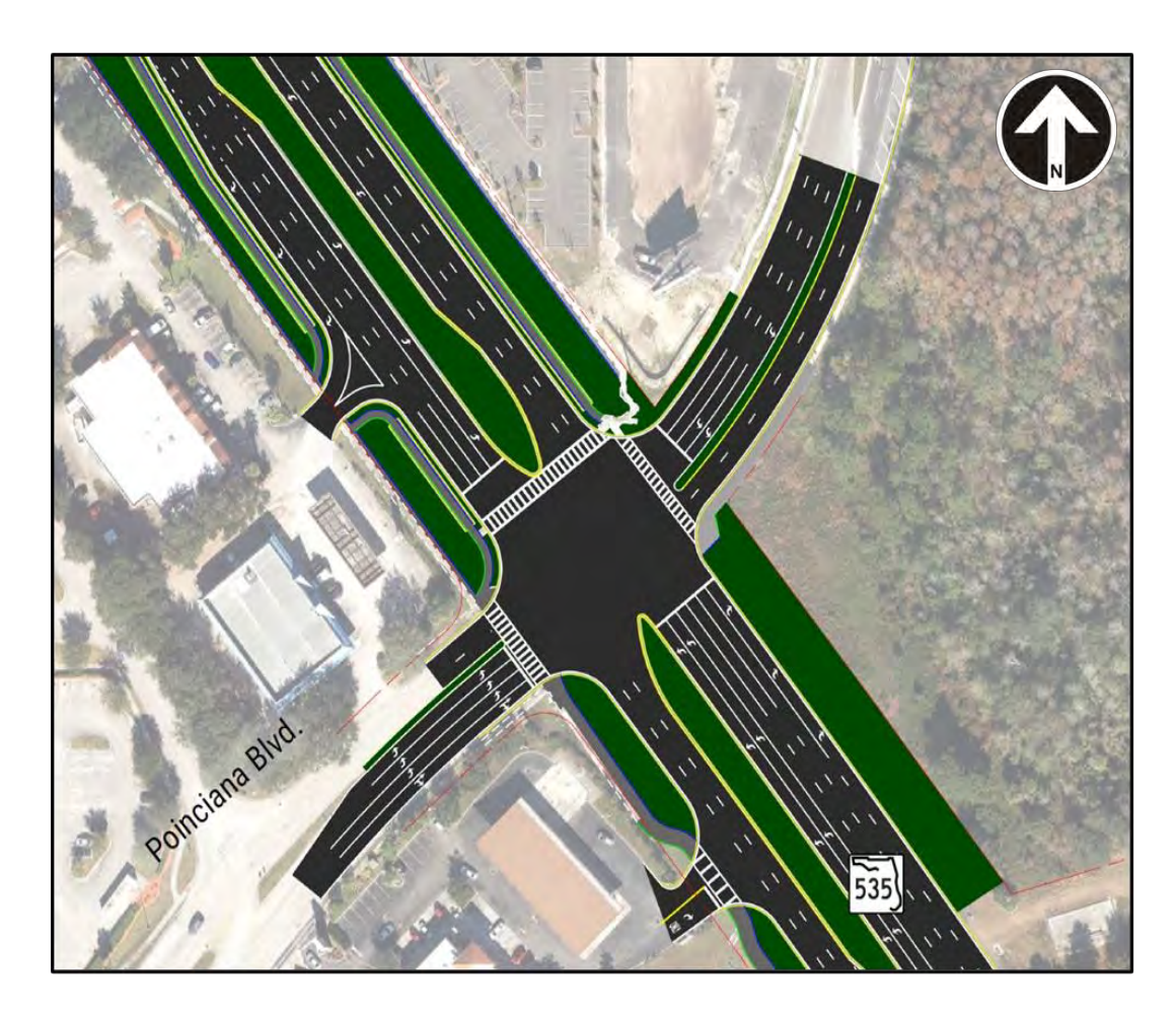
Figure 1-3 SR 535 and Poinciana Blvd Signalized Intersection Alternative

The SR 535 and Poinciana Boulevard traffic signal concept (see Figure 1-3 ) involves the installation of an additional lane along SR 535 for northbound and southbound movements and provision of triple eastbound left turn lanes.