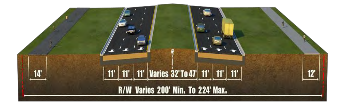
Figure 1.2 Preferred Typical Section

After a comprehensive alternative generation and evaluation process, one (1) alternative was selected as being the most effective option throughout the project corridor (see Figure 1-2 ). The preferred typical section consists of total reconstruction with the widening of the additional lane towards the median. This inside widening helps minimize potential impacts to the Florida Gas Transmission Line and at the various innovative intersections. The following information is a brief description of the preferred typical section. The typical section consists of three (3) 11-foot travel lanes in each direction with a 14-foot shared use path on the west side and a 12-foot sidewalk on the east side with a right-of-way varying between 200-feet to 224-feet.