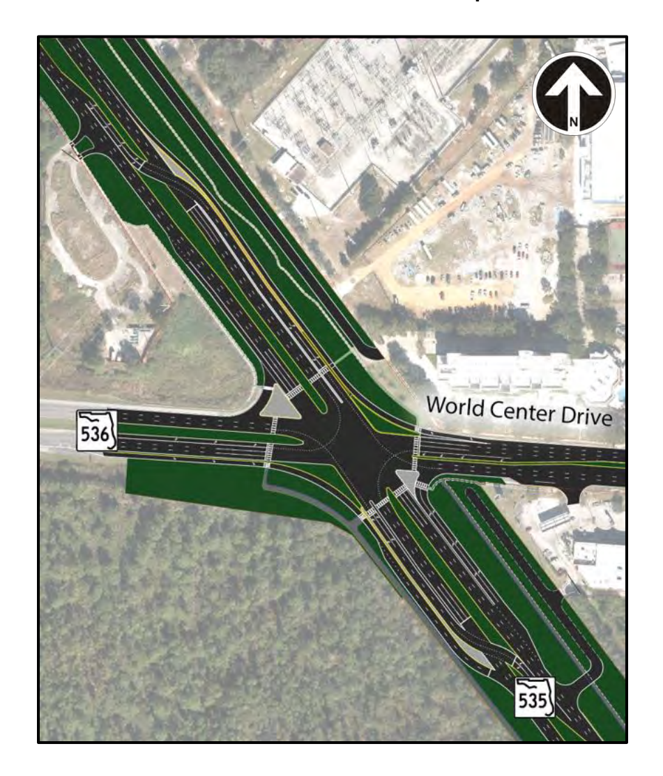
Figure 1-6 SR 535 and SR 536/World Center Dr Partial Displaced Left Turn Alternative