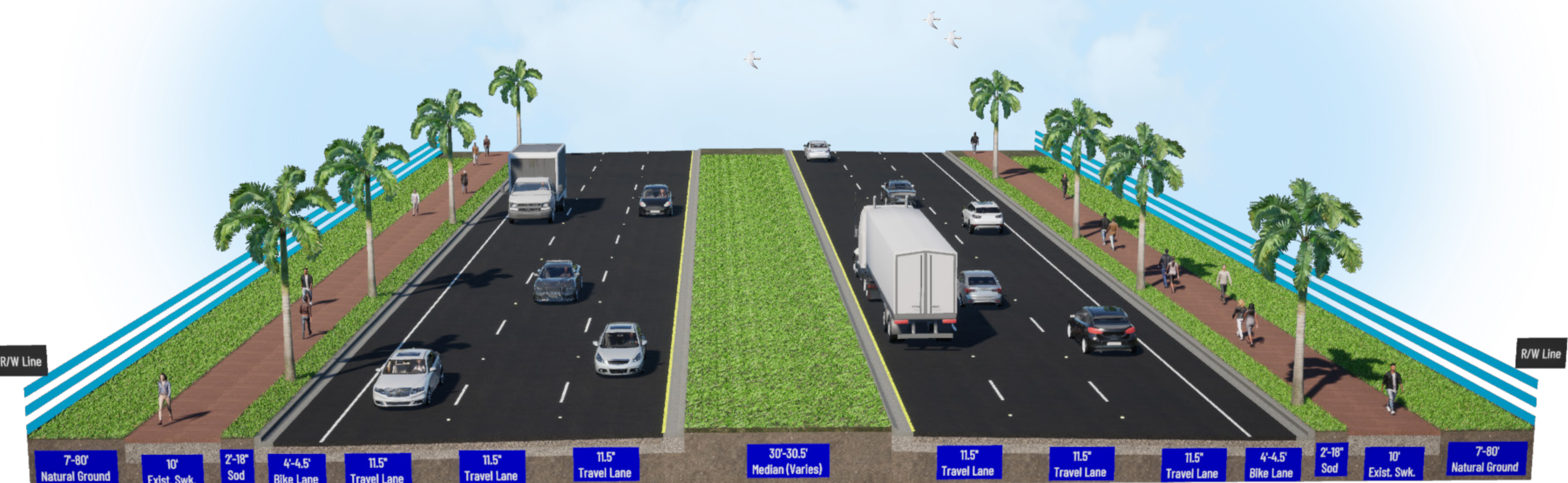
Margaritaville Boulevard to Reedy Creek Bridge

Stay up to date with project information by scanning the QR code to visit the project website