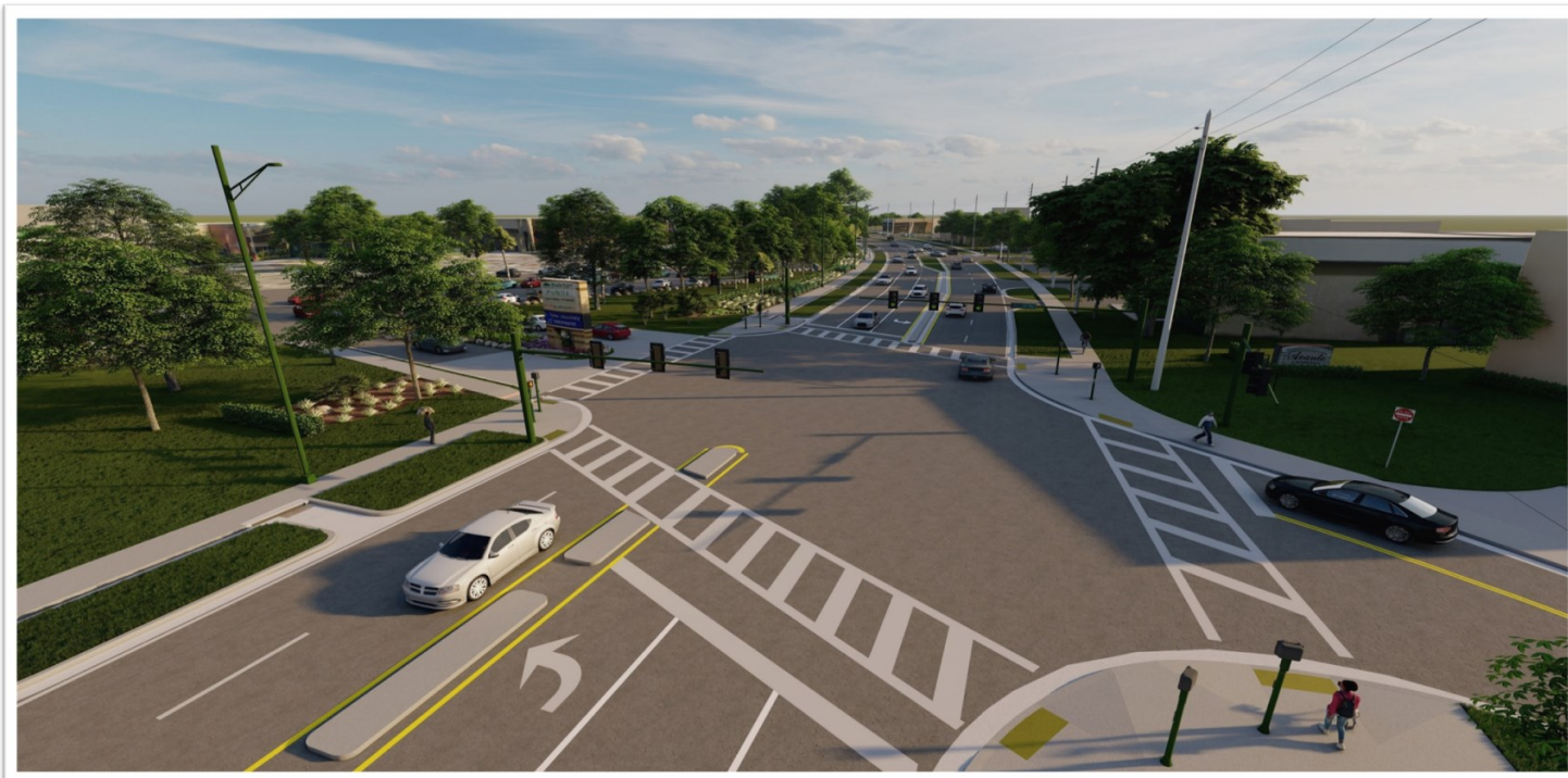
Rendering of Proposed Configuration at Shadow Lakes Boulevard