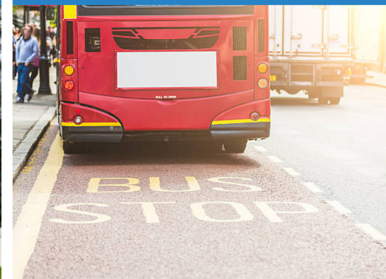
▼ Bus Stop Painted in Outside Lane