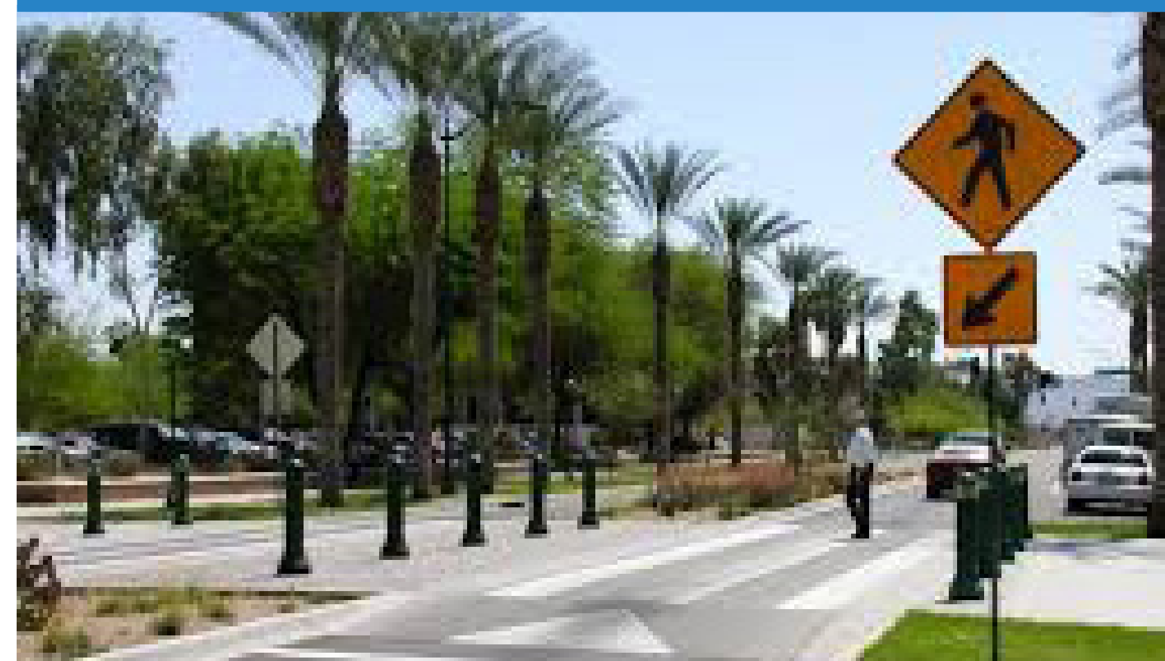
▼ Raised Crosswalks