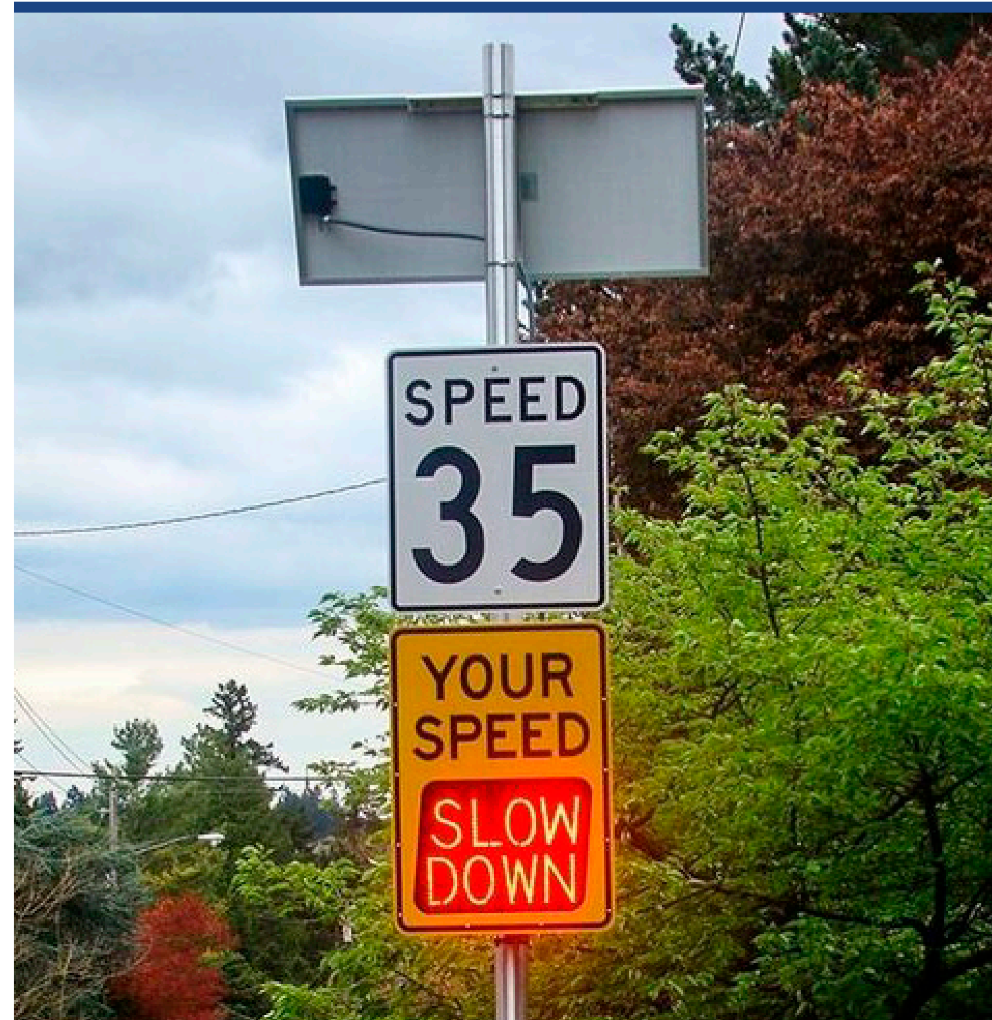
▼ Speed Radar Sign