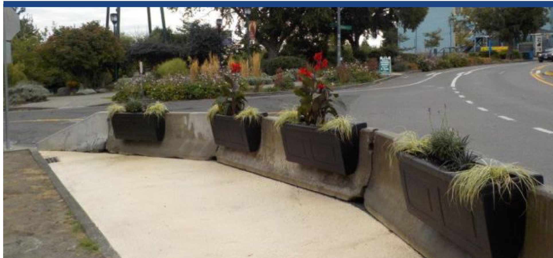
▼ Concrete Barrier Wall with Sidewalk