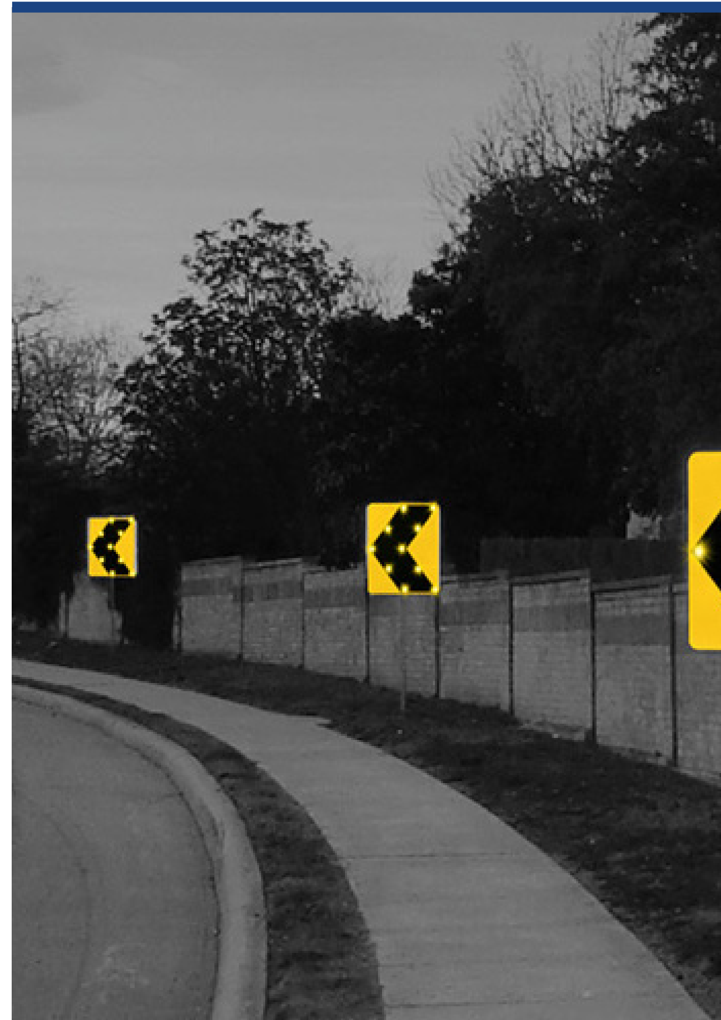
▼ Dynamic Chevron Signs