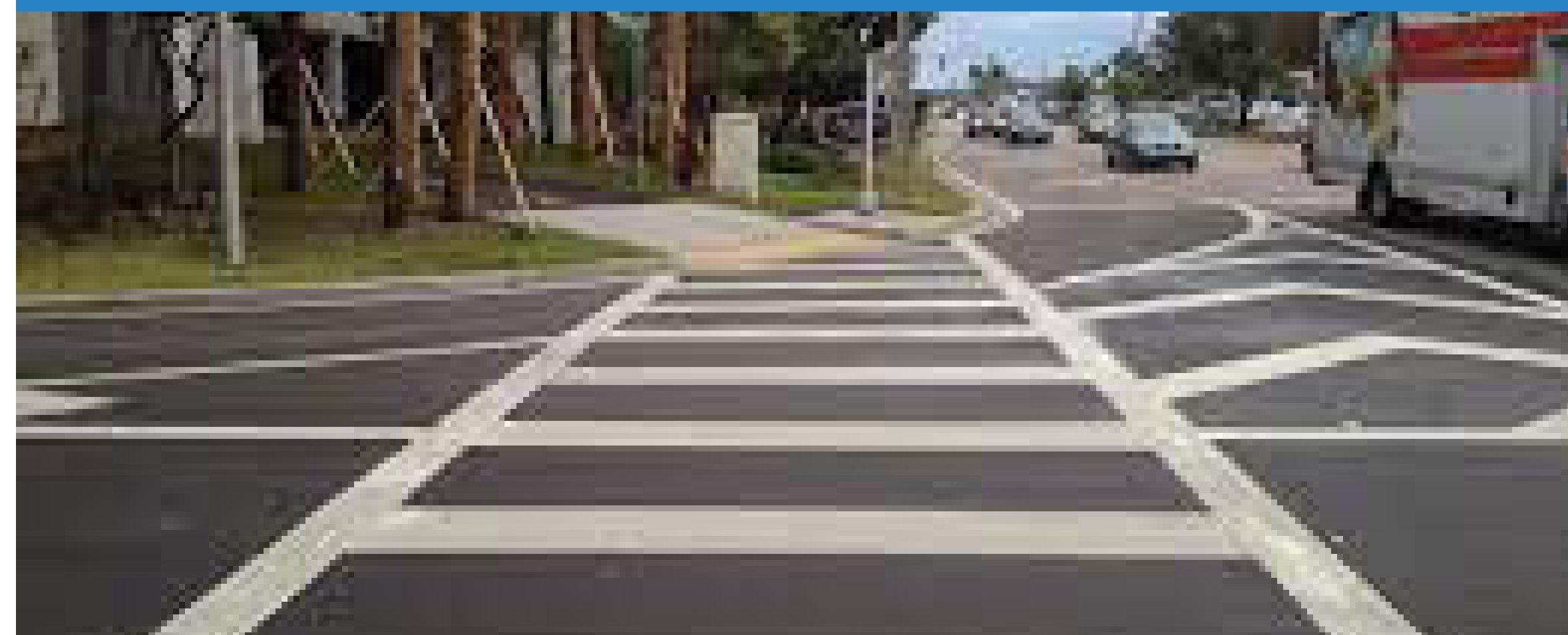
▼ High Visibility Crosswalks