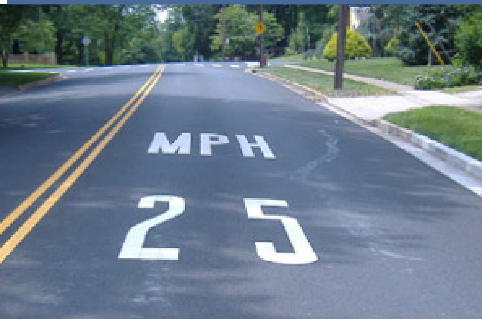
▼ Pavement Markings