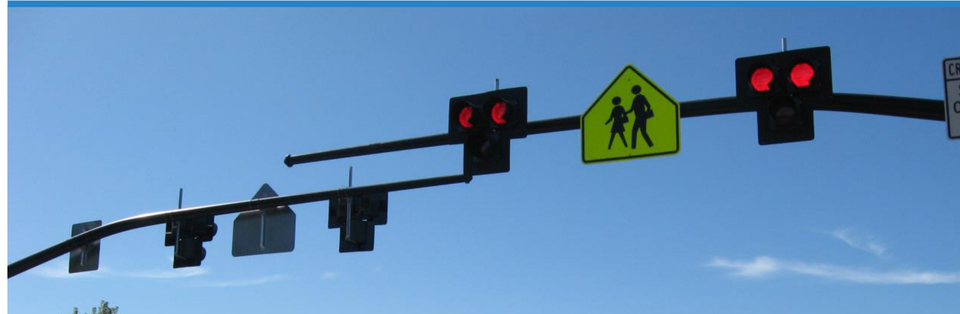
▼ Pedestrian Hybrid Beacon