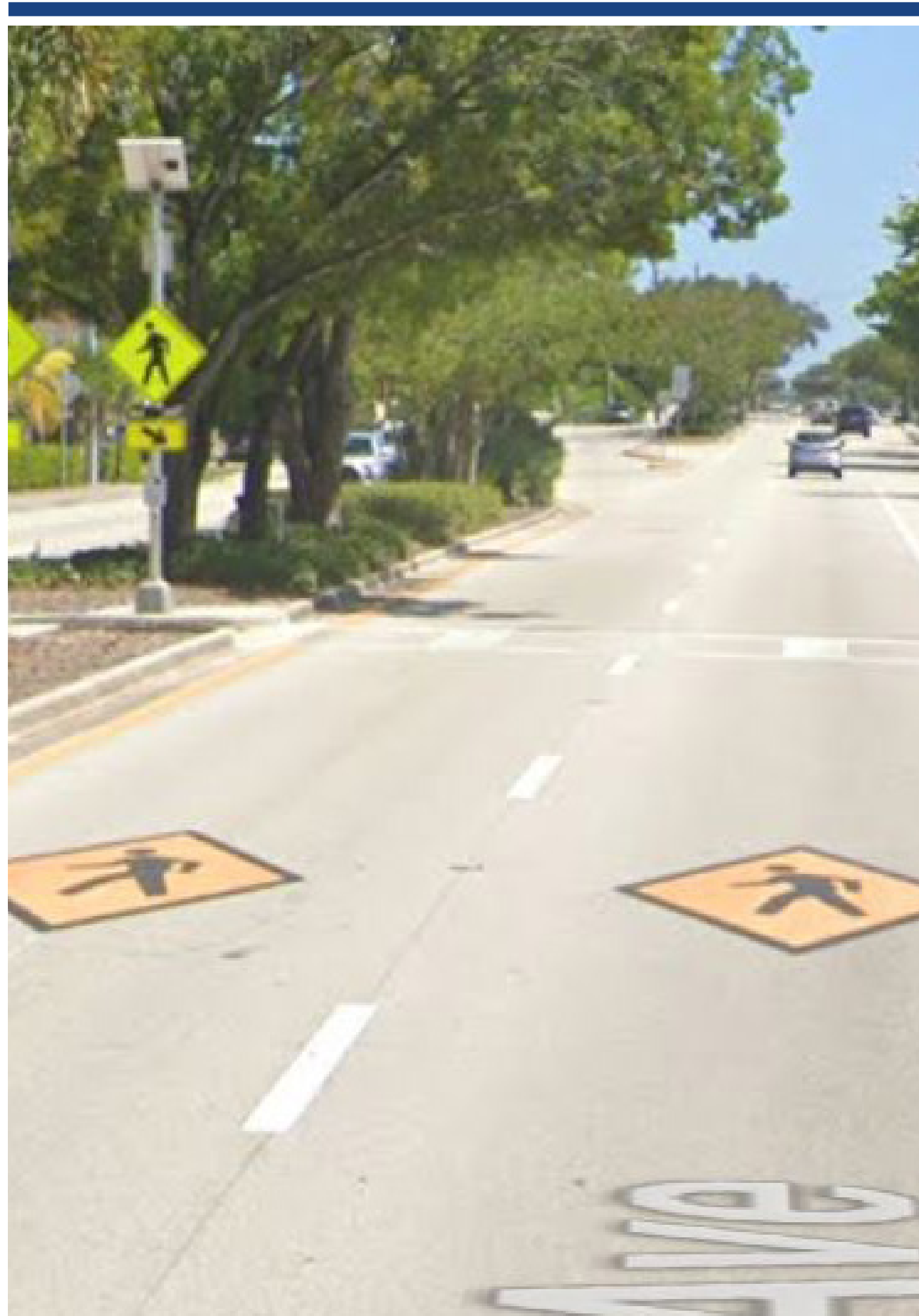
▼ Thermoplastic Decal on Roadway