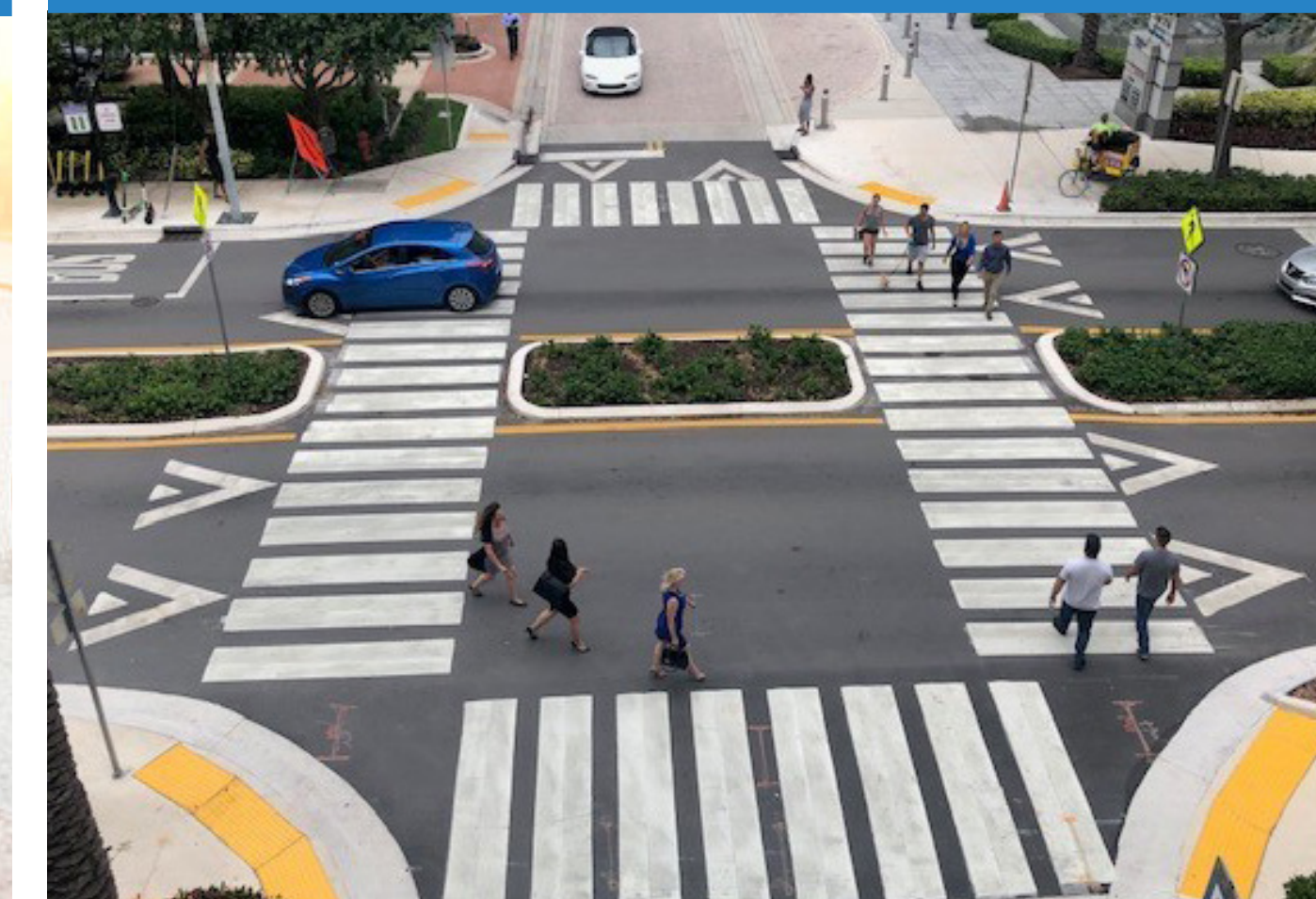
▼ Raised Intersection