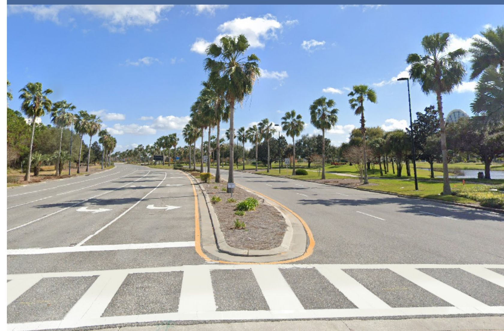
▼ Narrow Medians