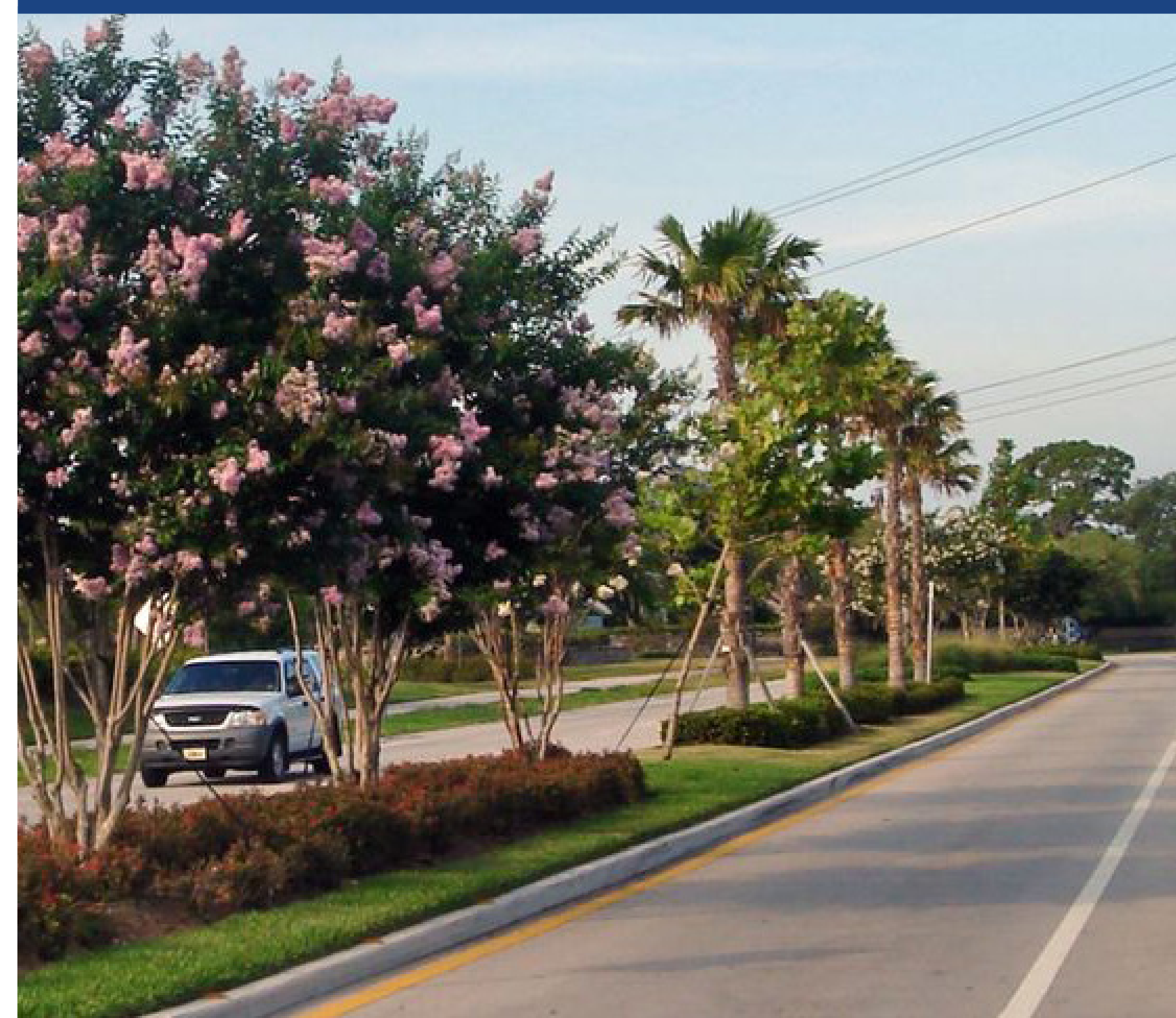
▼ Vertical Landscaping