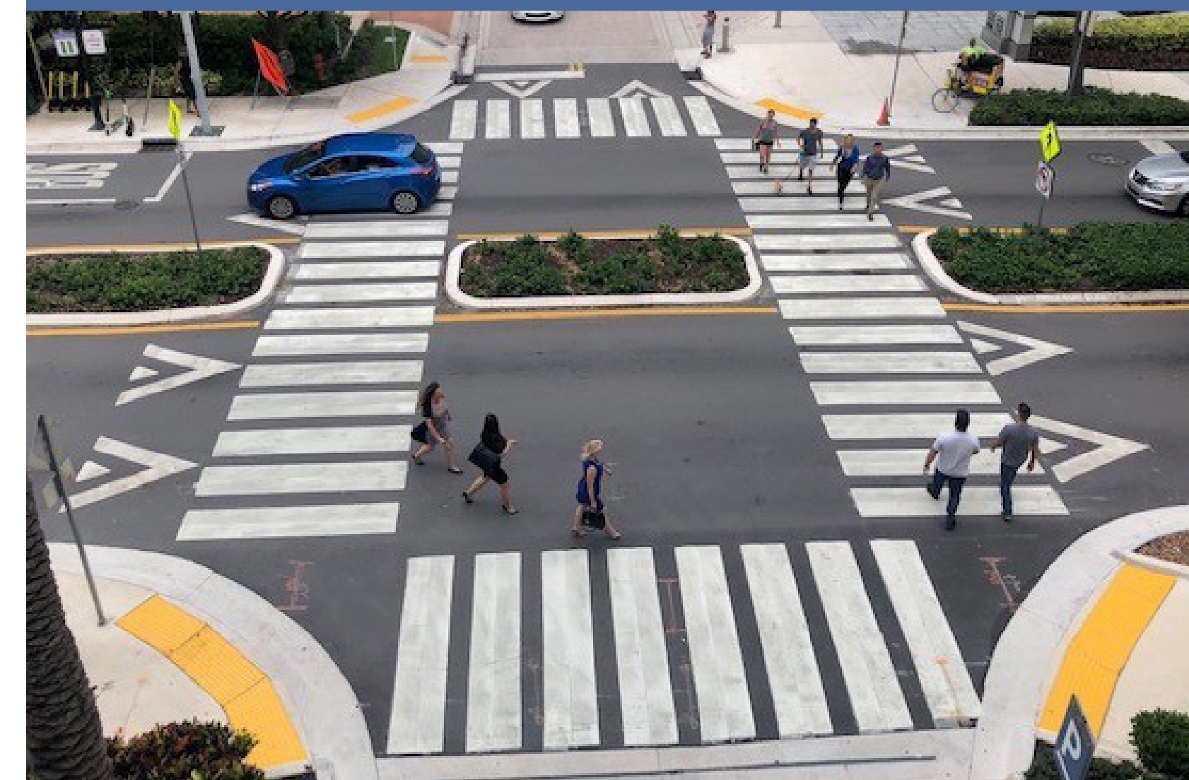
▼ Raised Intersection