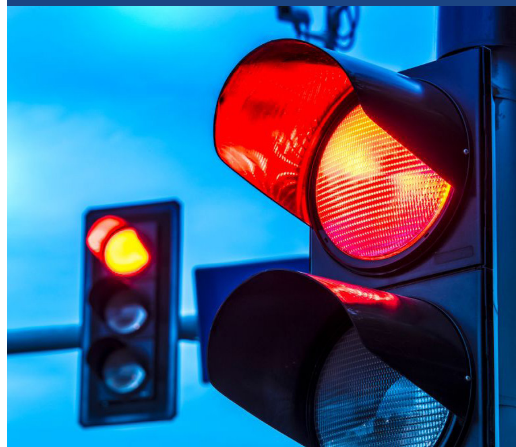
▼ Signal Retiming