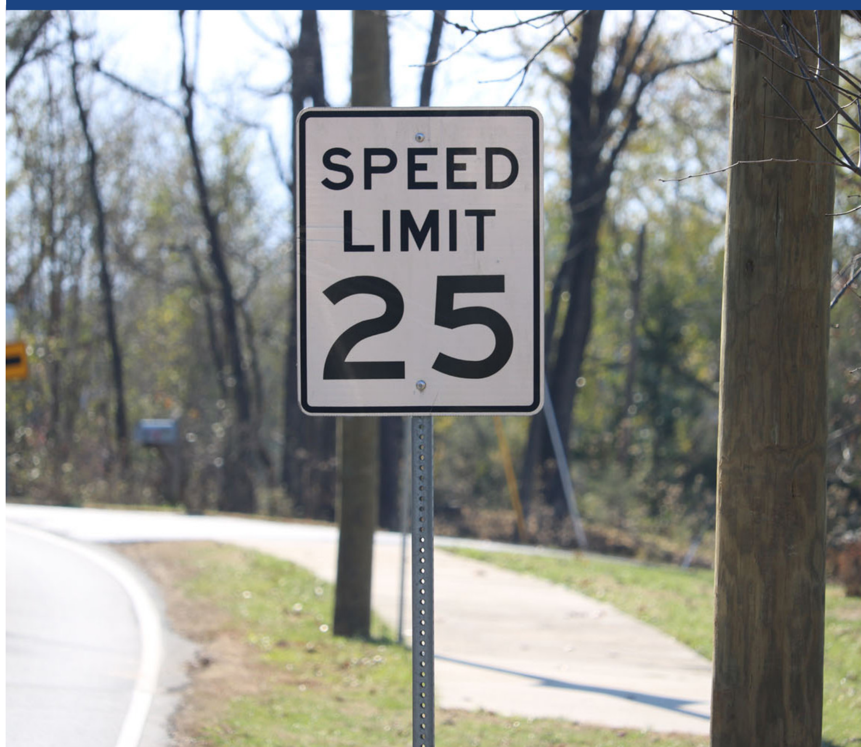
▼ Lower Speed Limit