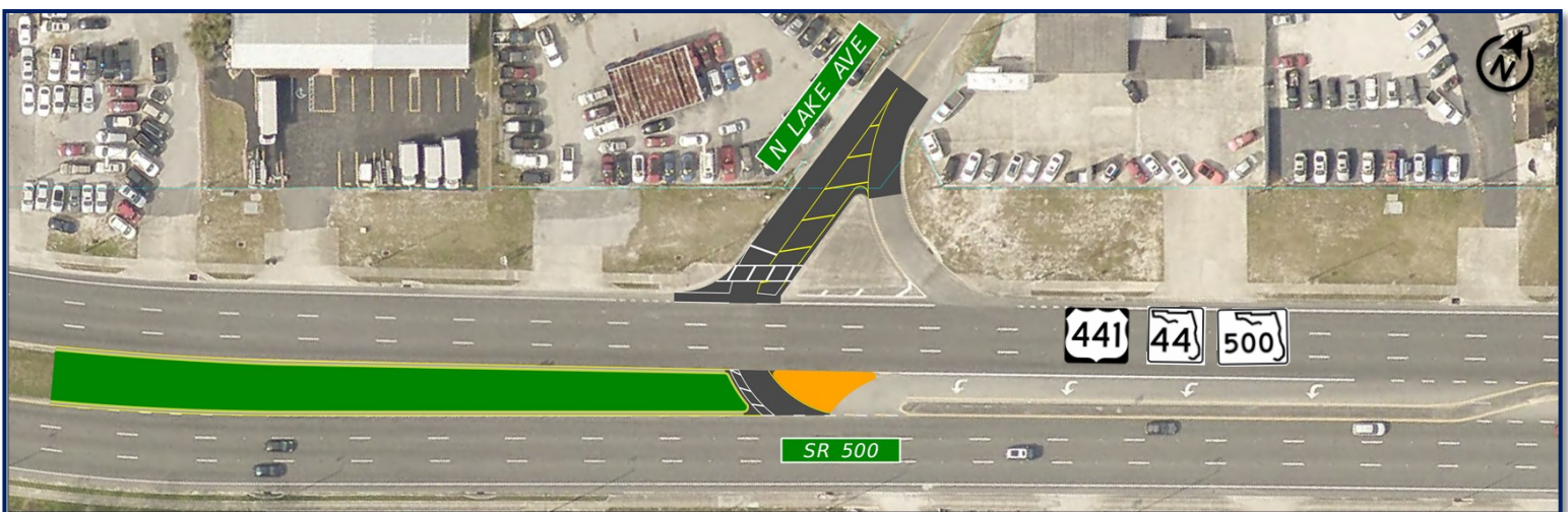
Figure 3: Median Modification at North Lake Avenue