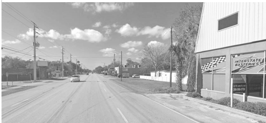
West of Edwards Street—Facing Westbound