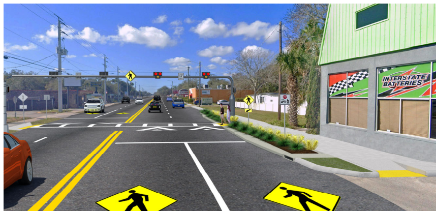
(*) Improvement shown graphically within proposed rendering