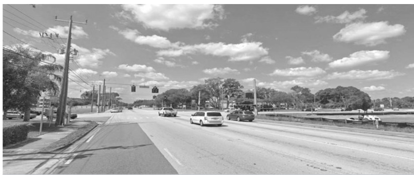
East of Clyde Morris Boulevard—Facing Westbound