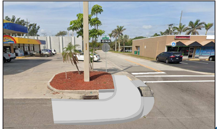
Drainage improvements for South 1st Street

SEE REVERSE SIDE FOR PROJECT LOCATION MAP