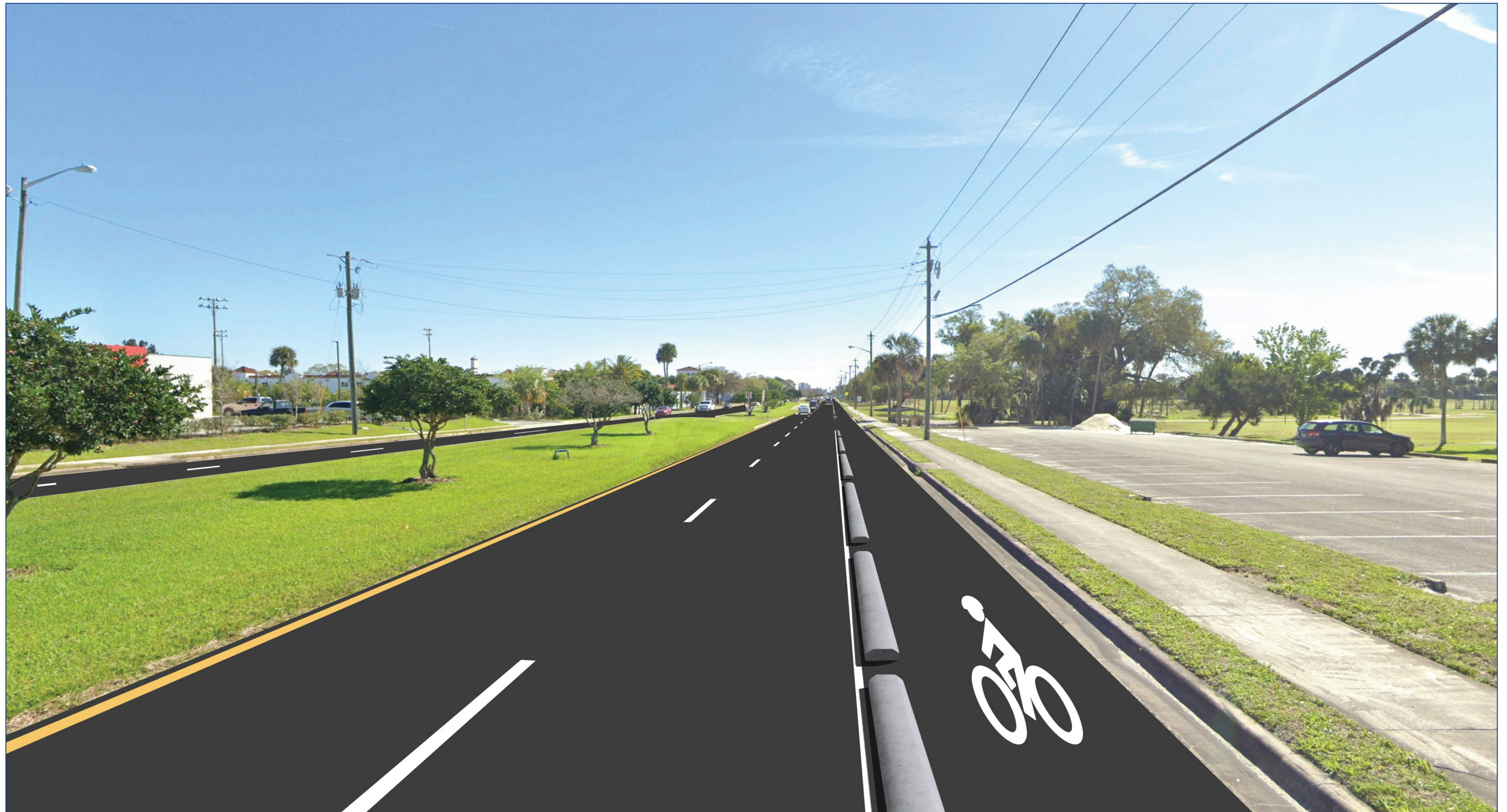
Street View with Buffered Bicycle Lane