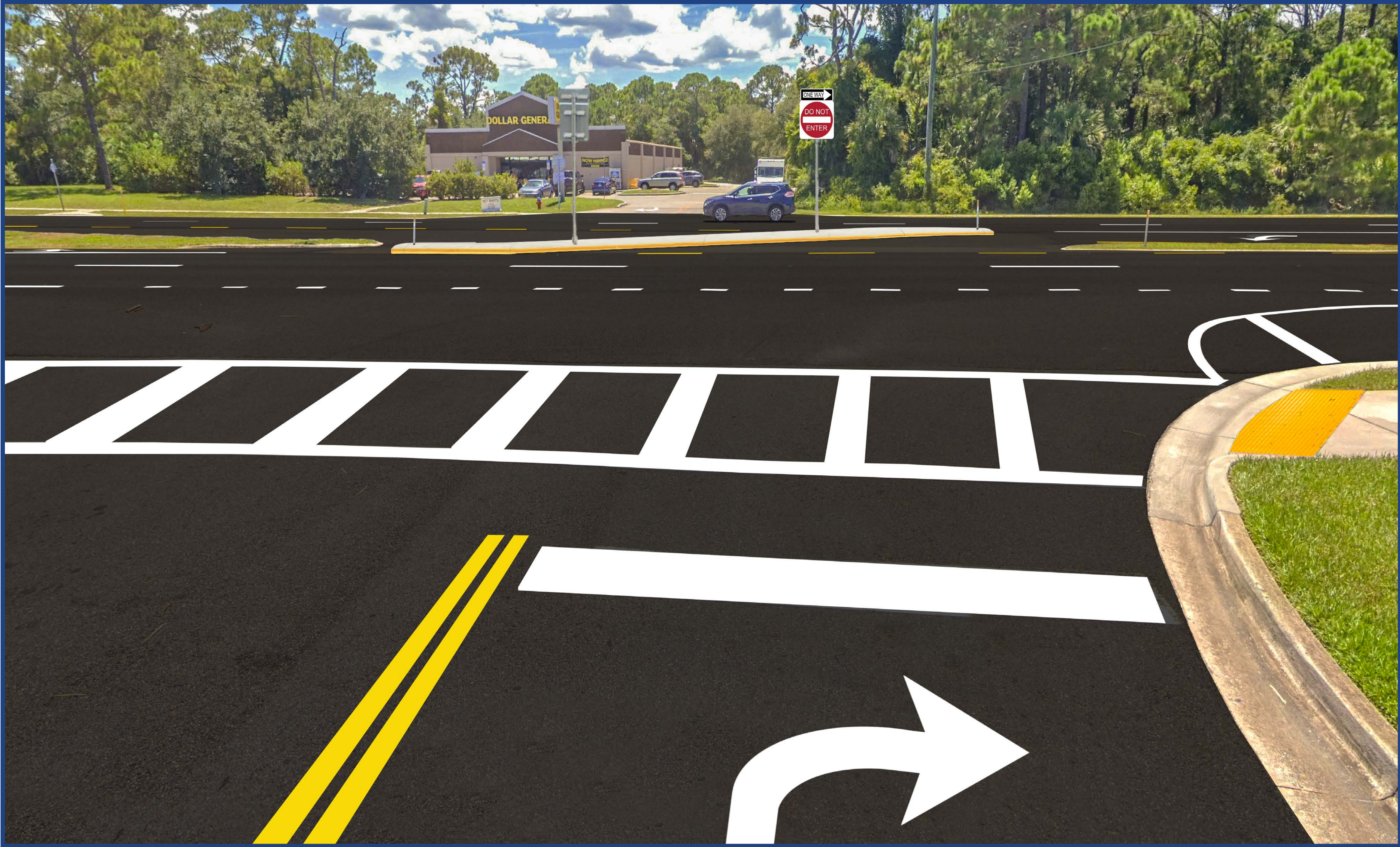
Artist Rendering: View from westbound Homeport Terrace

Stay up to date with project information by scanning the QR code to visit the project website