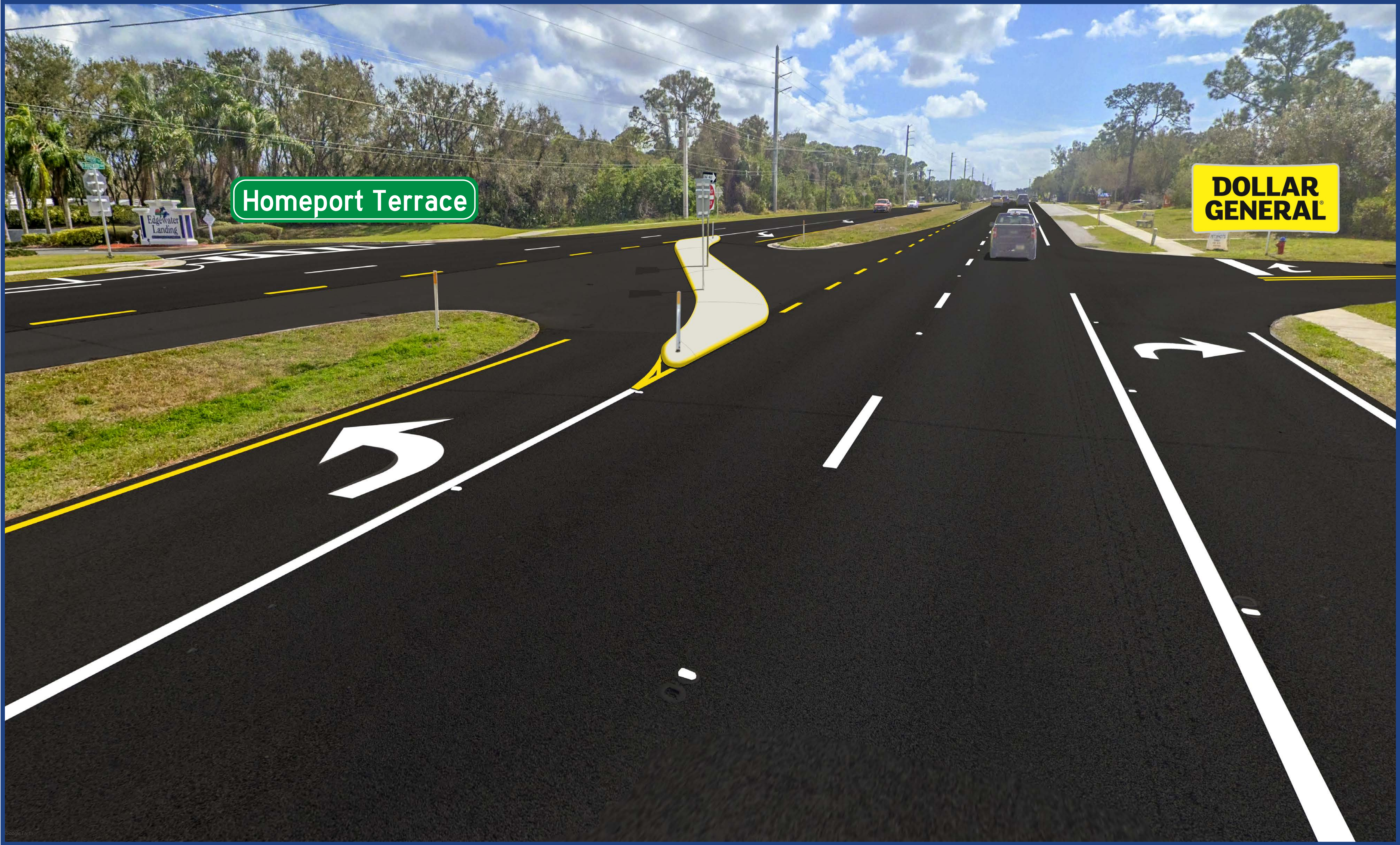
Artist Rendering: View from southbound U.S. 1

Stay up to date with project information by scanning the QR code to visit the project website