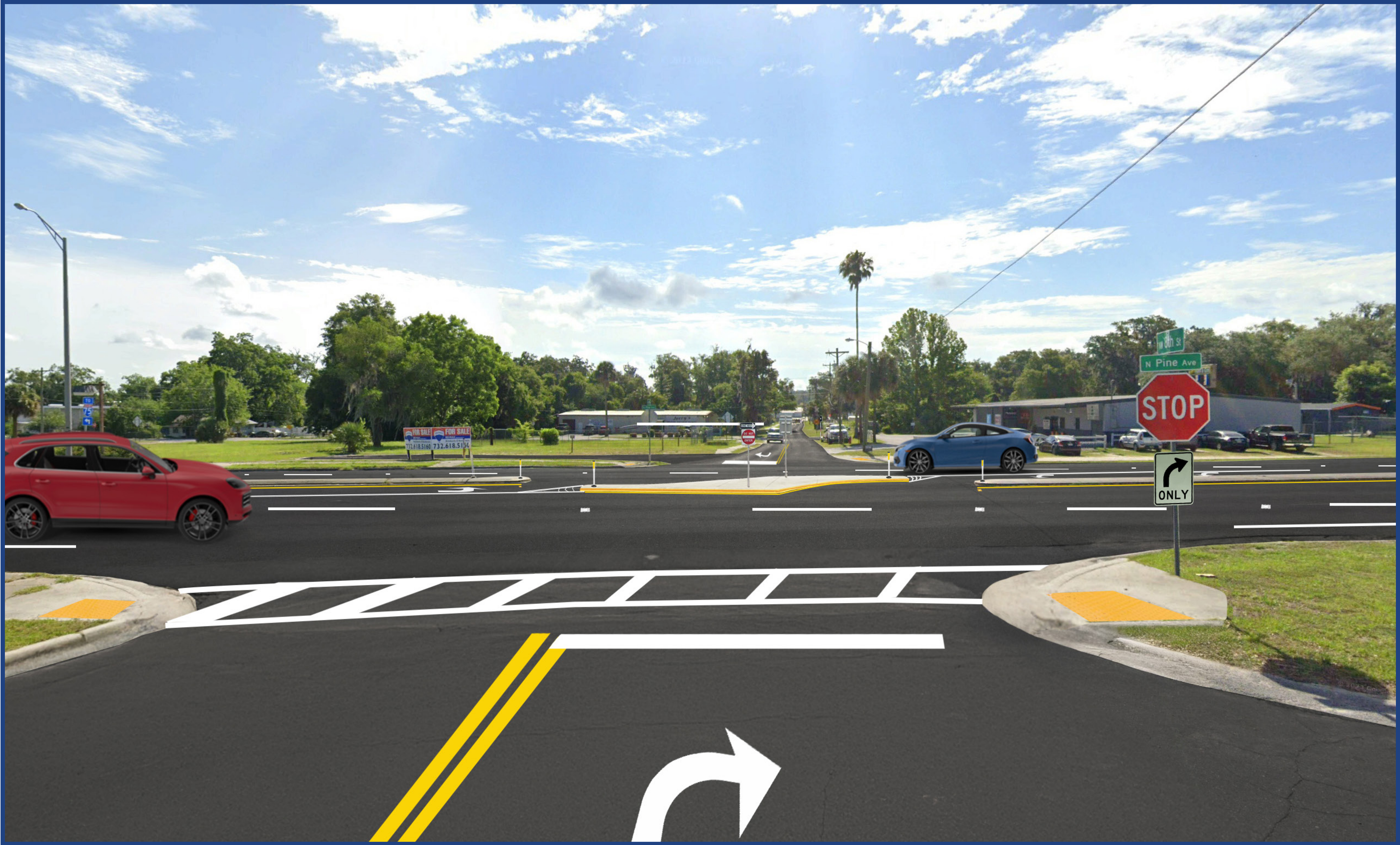
Artist Rendering: View from Eastbound NW 8th Street

Stay up to date with project information by scanning the QR code to visit the project website