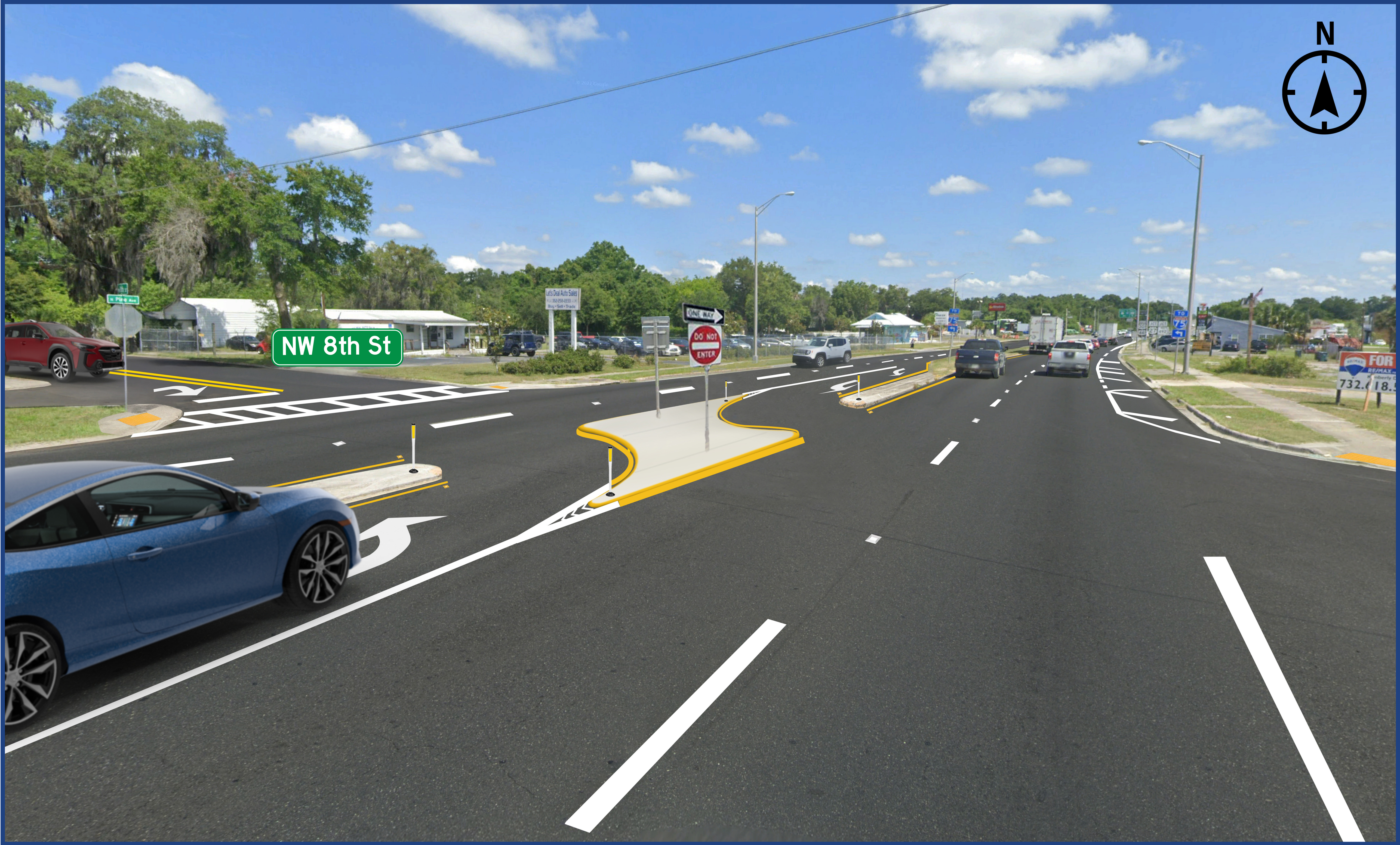
Artist Rendering: View from Northbound U.S.27/301/441

Stay up to date with project information by scanning the QR code to visit the project website