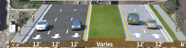
Proposed U.S. 17-92 Typical Section (from Lee Road to South of Monroe)