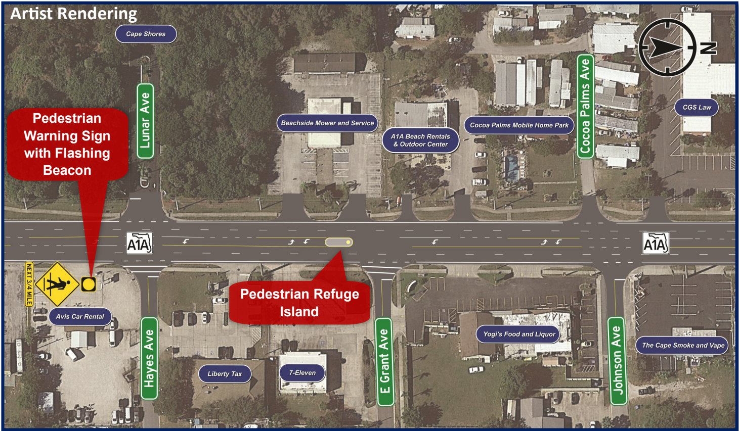
Figure 1: Proposed Pedestrian Refuge Island at Grant Avenue