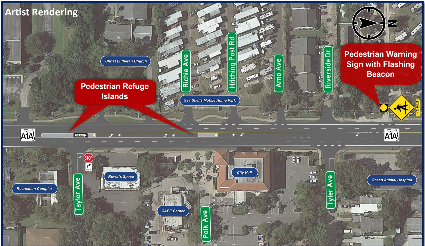
Figure 2: Proposed Pedestrian Refuge Islands at Taylor Avenue and Polk Avenue