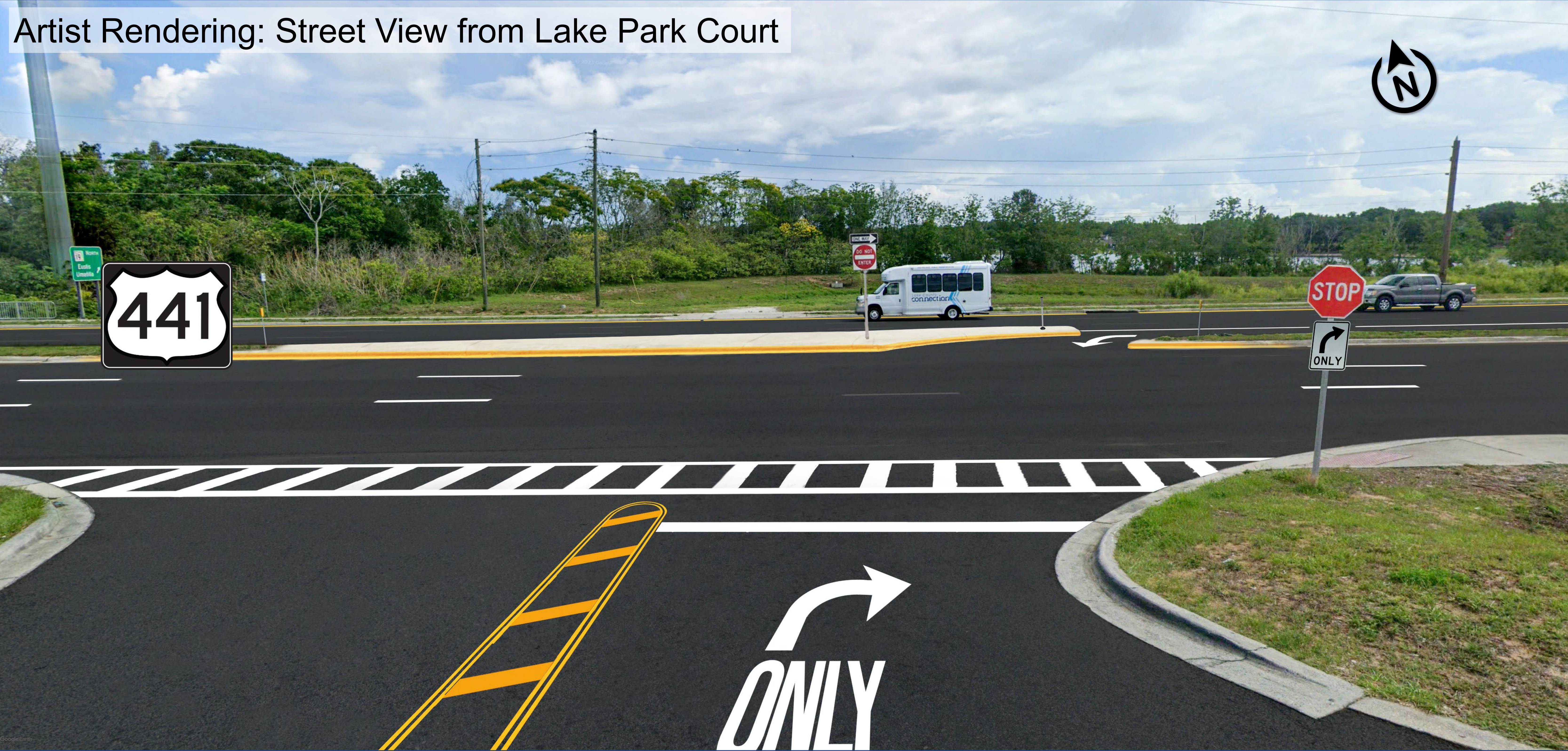
Artist Rendering: Street View from Lake Park Court